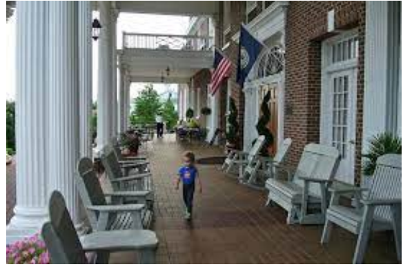
Tuesday & Wednesday the 10th & 11th.

The Mimslyn Inn is listed as an Historic Hotel by The National Trust for Historic Preservation and has a restaurant, bar, and front porch overlooking an extensive lawn. Meals will be on your own. As well, there are multiple eating choices within a 10 minute walk.