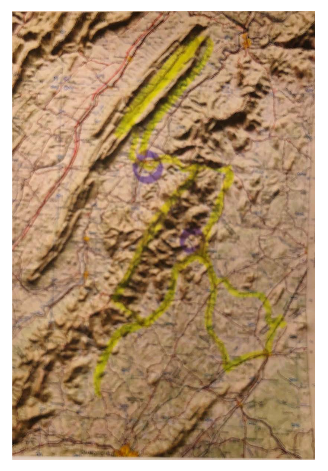
The FORT VALLEY is at the top in yellow, blue circle just below is town of LURAY, and the other blue circle is SYRIA. Day routes are shown in yellow.