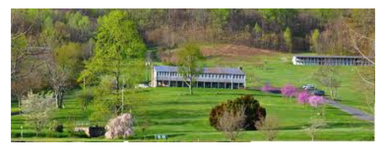
Meals are served in the large building at the center. Up & right is the 22-room RIDGECREST which, with its function room, is fully reserved for us. Mostly obscured to the left is HILLTOP, where we have a 10-room block. The "line" across the bottom of the photo is your home syphoning stream.

In RIDGECREST, along with our 22 rooms, is a functions room for us for the duration of our stay. Would anyone organize a games night? Would there be interest in having a square dance with a caller and local string band for one of those nights? We have two free nights here, Monday and Thursday.