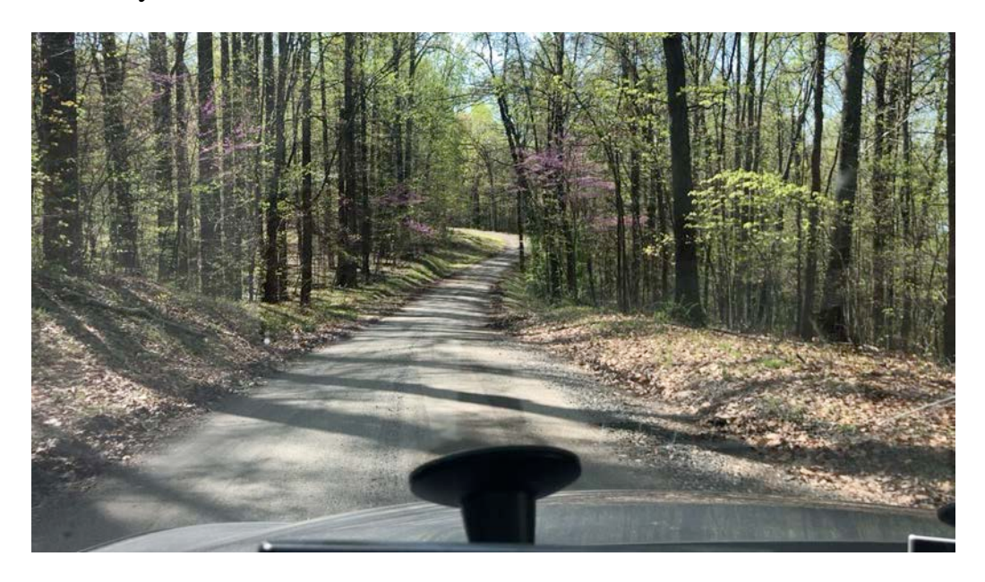
Driving along the 12-mile back road into Syria: April 13, 2021.

The Sheetz in the town of Madison, 8 miles from Graves Mountain Lodge, has kerosene and Diesel. Thirty-five miles into Monday's drive you will have both kerosene and Diesel in the town of Orange. In Luray Tuesday afternoon, all day Wednesday, and early Thursday, there is Kerosene & Diesel at East End EXXON , only 1.1 miles from our lodging. If you depart Luray on Thursday with a full tank you will easily get back the the Sheetz at Madison. Top up there and you will be fine for Friday's drive.