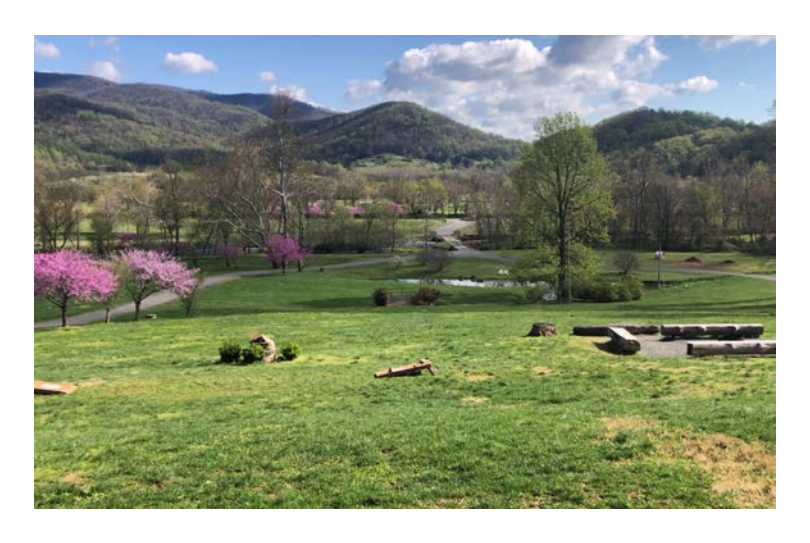
April view from Graves Mountain Lodge, Syria, VA.